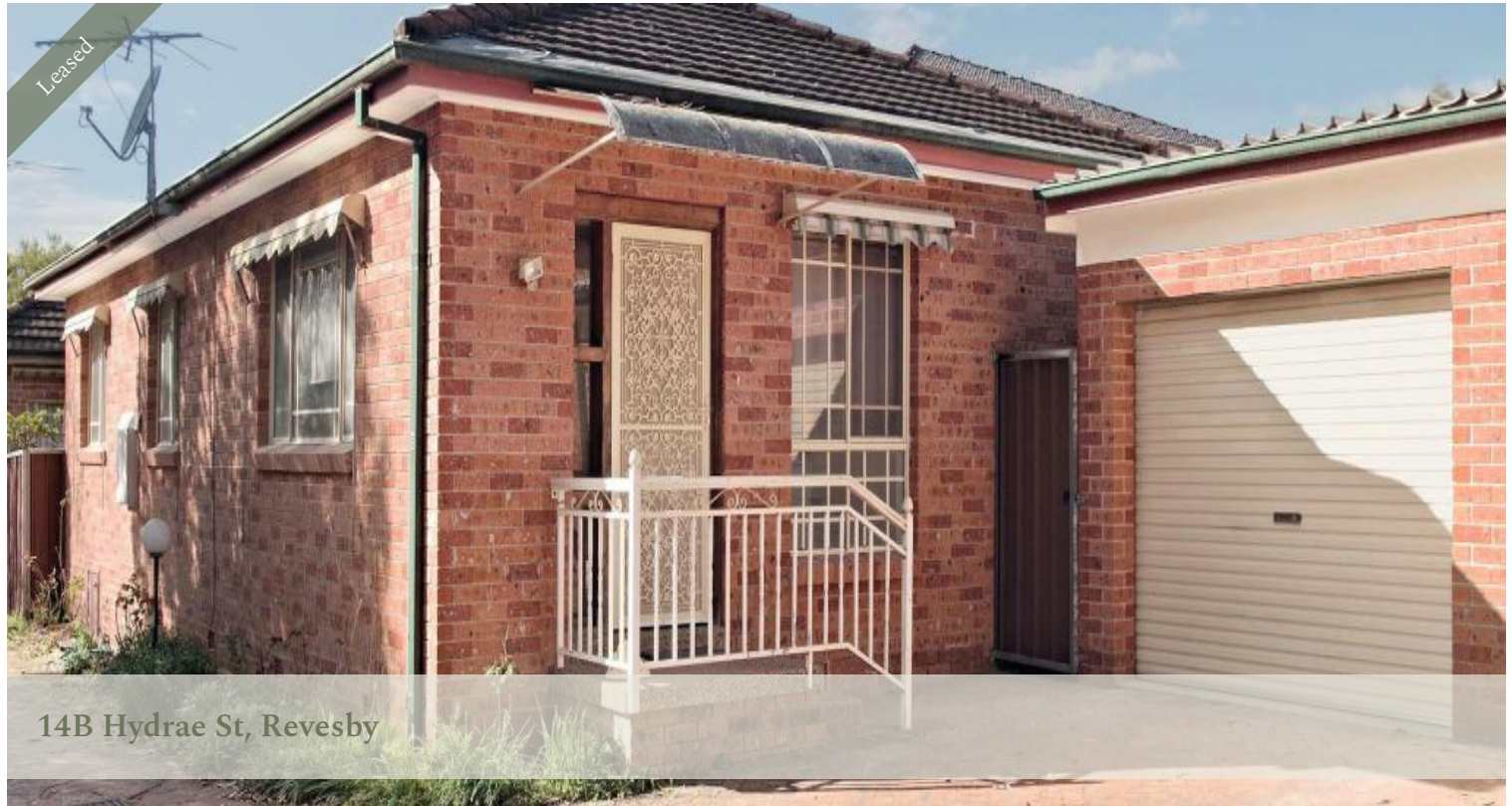
14B Hydrae St, Revesby