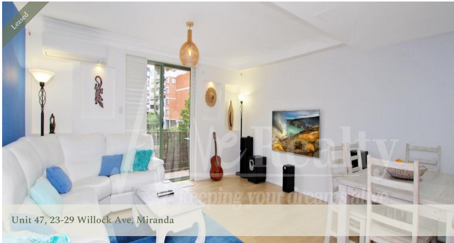
Unit 47, 23-29 Willock Ave, Miranda