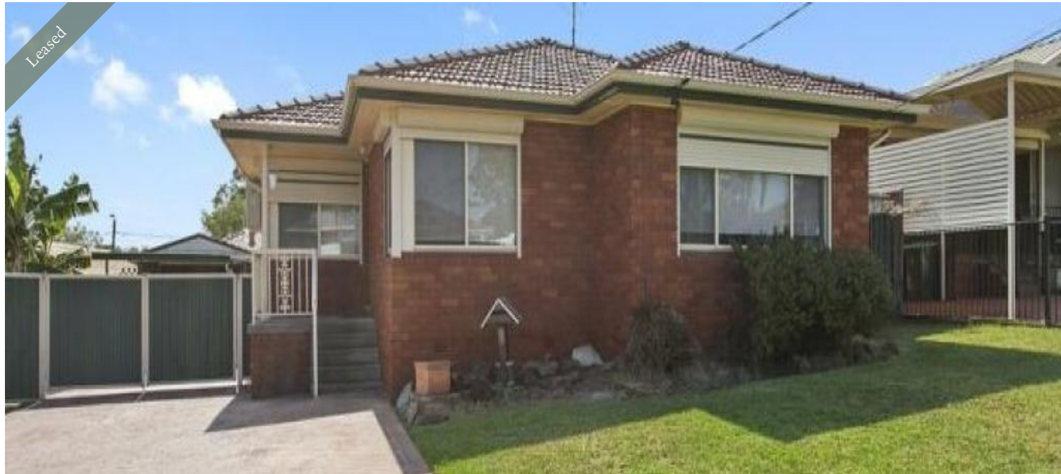
1 Ayres Crescent, Georges Hall