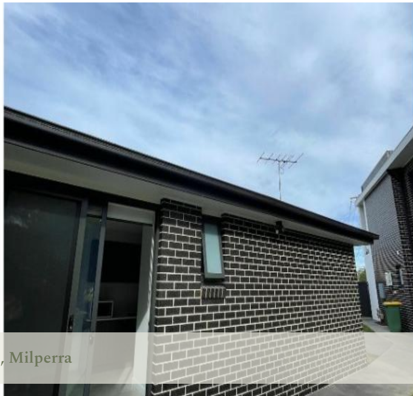
Unit 1, 13 Keysor Pl, Milperra