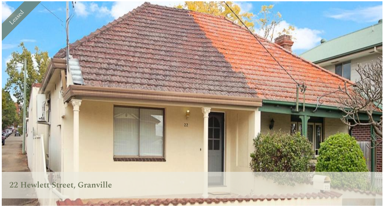
22 Hewlett Street, Granville