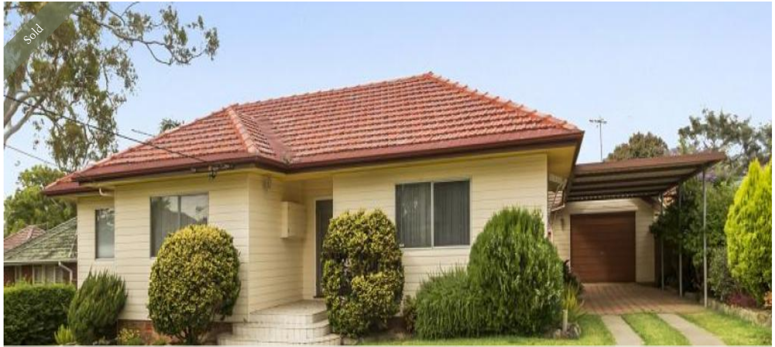
7 Forrest Road, East Hills