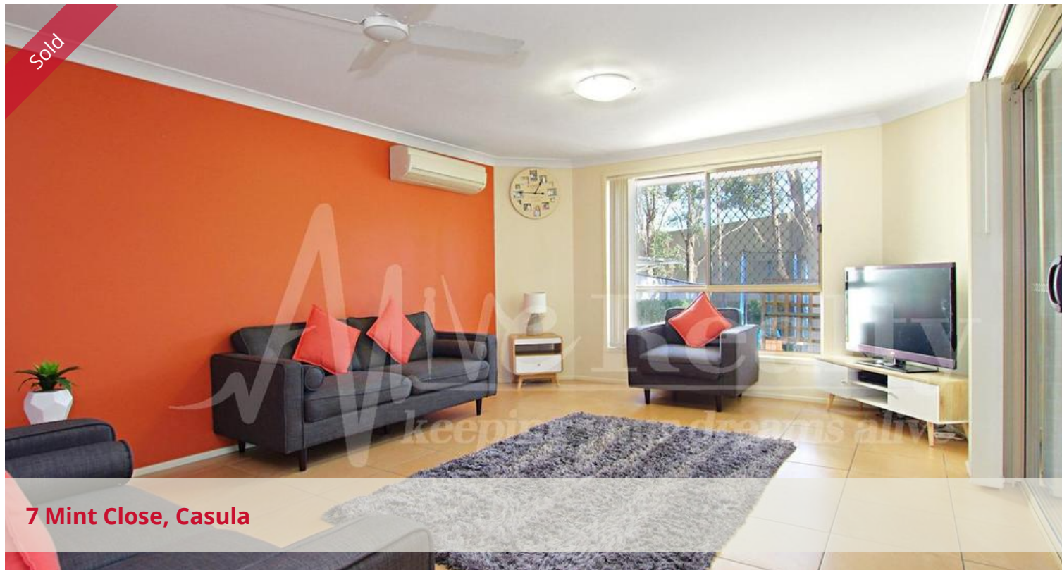
7 Mint Close, Casula