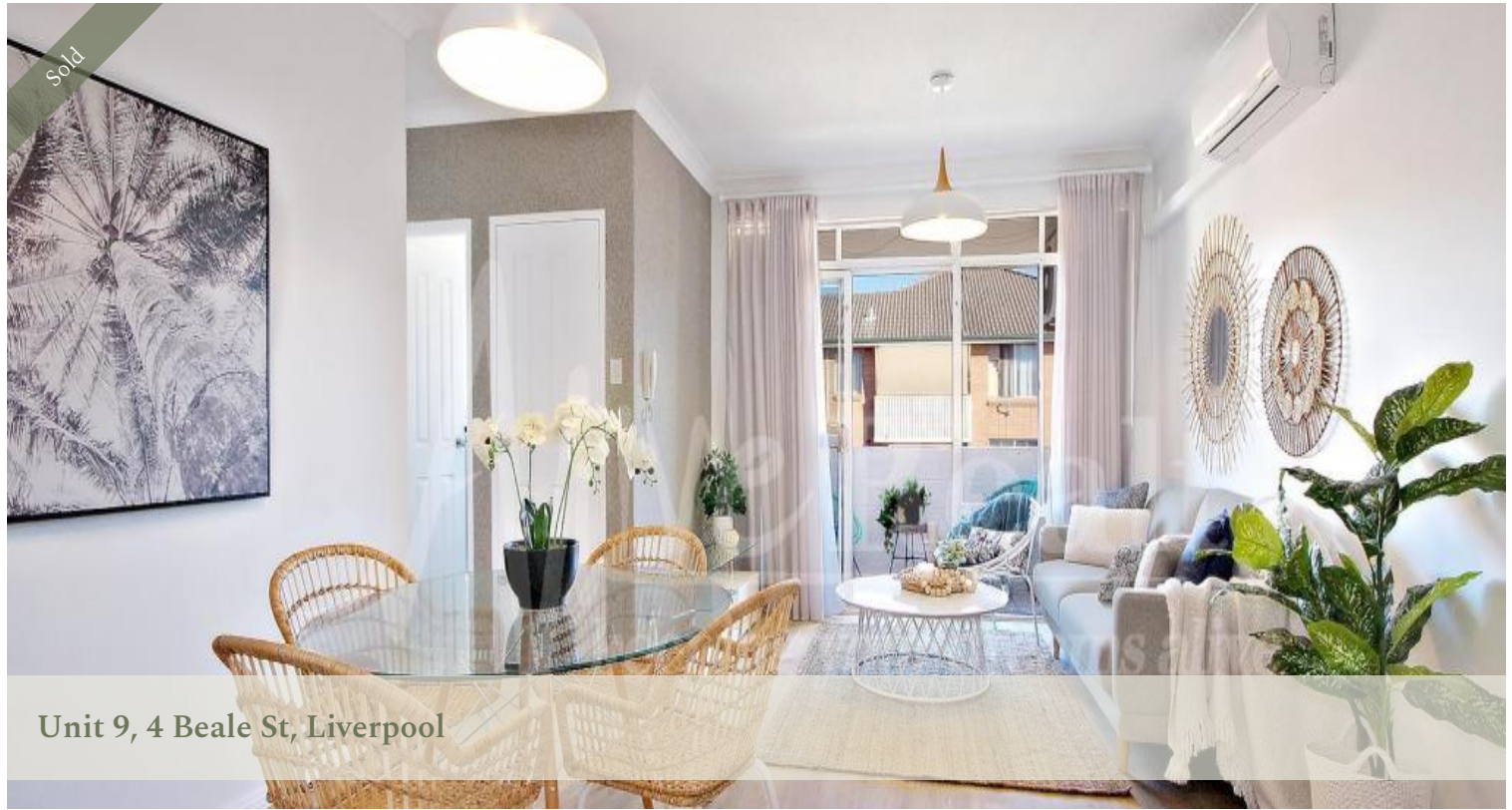
Unit 9, 4 Beale St, Liverpool